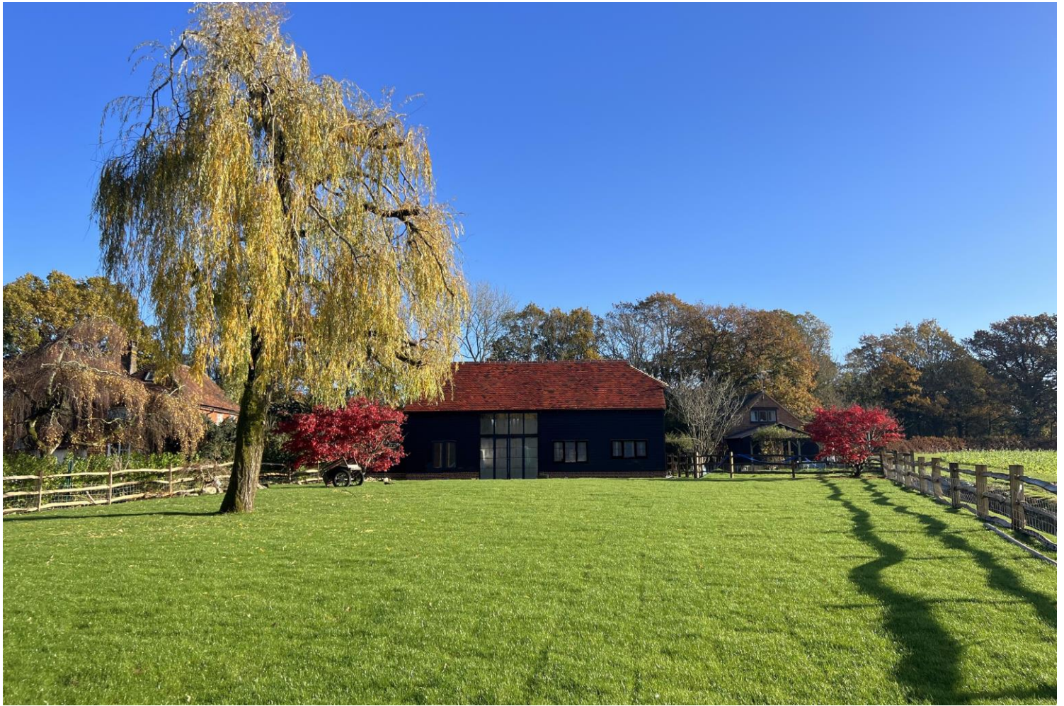
Willow Barn, Knowle Lane, Cranleigh, GU6 8JW